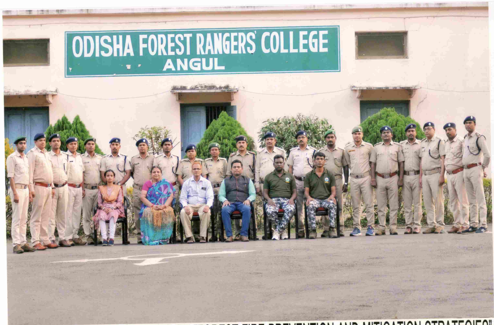
REFRESHER COURSE TRAINING ON "FOREST FIRE PREVENTION AND MITIGATION STRATEGIES" OF FRONTLINE STAFF (DEPUTY RANGERS/FORESTERS/FOREST GUARDS) FROM 06.11.2023 TO 10.11.2023 AT ODISHA FOREST RANGERS' COLLEGE, ANGUL